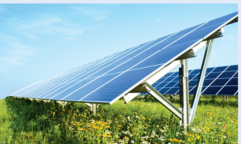
In January 2023 the Minnesota Erosion Control Association awarded Hoot Lake Solar its Environmental Excellence award. The site also includes pollinator-friendly and native habitats for wildlife cover, food, and nesting areas.